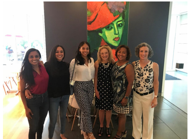
Columbus event at the Columbus Museum of Art