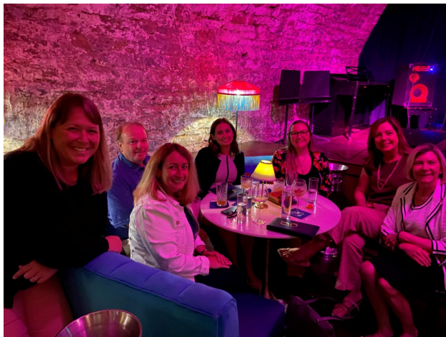
Cincinnati event at Ghost Baby in Over the Rhine